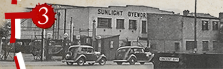
The Sunlight Dye Works and Laundry

2 16, Wilton Road From 18th June 1943, 'Two Sheds' behind this house were on a list of requisitioned Supermarine sites. They were most likely used to store parts produced at our next stop on Winchester Rd.