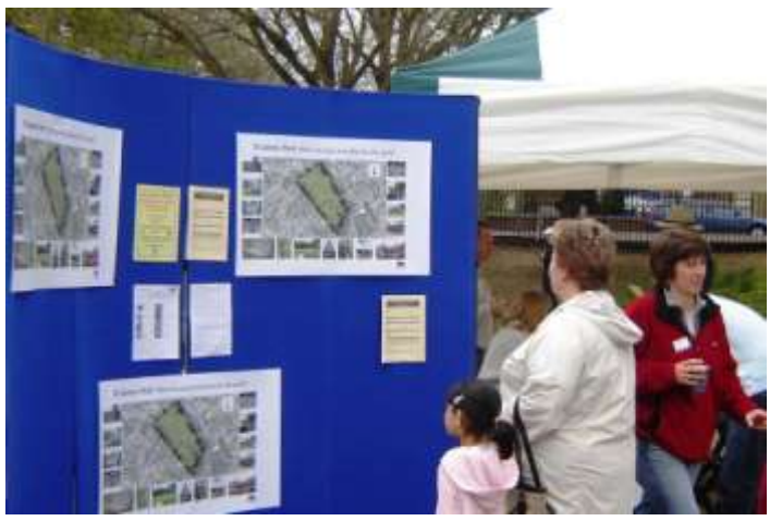
Information, questionnaires and membership at the FOSJP launch.