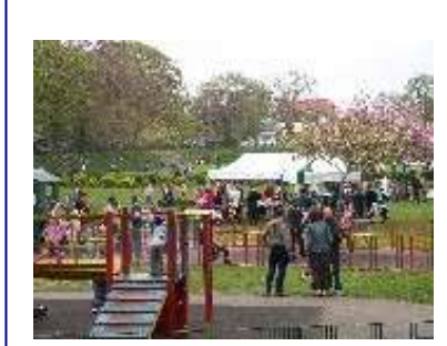
The Launch at the Noise event.