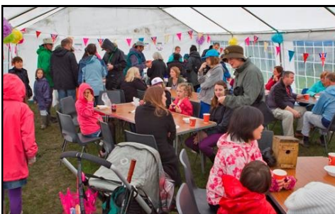
the very popular FoSJP tea tent

We'd like to extend a huge thank you to everyone who supported the event: volunteers, cake makers, business, schools, charitable organisations, and everyone who came to the park to make the BIG Event a BIG Success!