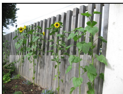
sunflowers in heritage frieze bed