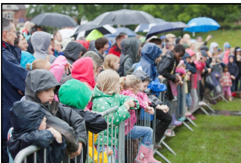
eagerly awaiting the next performance...